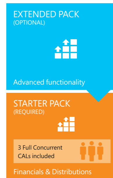
Figure 4: Extended Pack

The first three Full Users included in the Start Pack get to access to all of the incremental functionality.