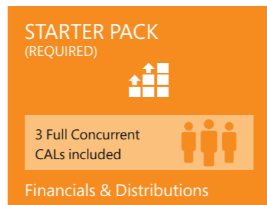
Figure 3: Starter Pack

For many businesses, this is the only license component required.